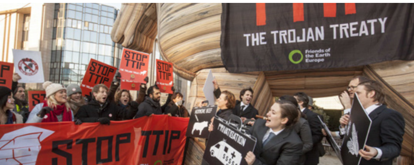
Protests in Brussels against the planned free trade agreement TTIP

Foreign investors can access national courts, just like everyone else in society. There is no justification for creating a parallel legal system that is biased in their favour.