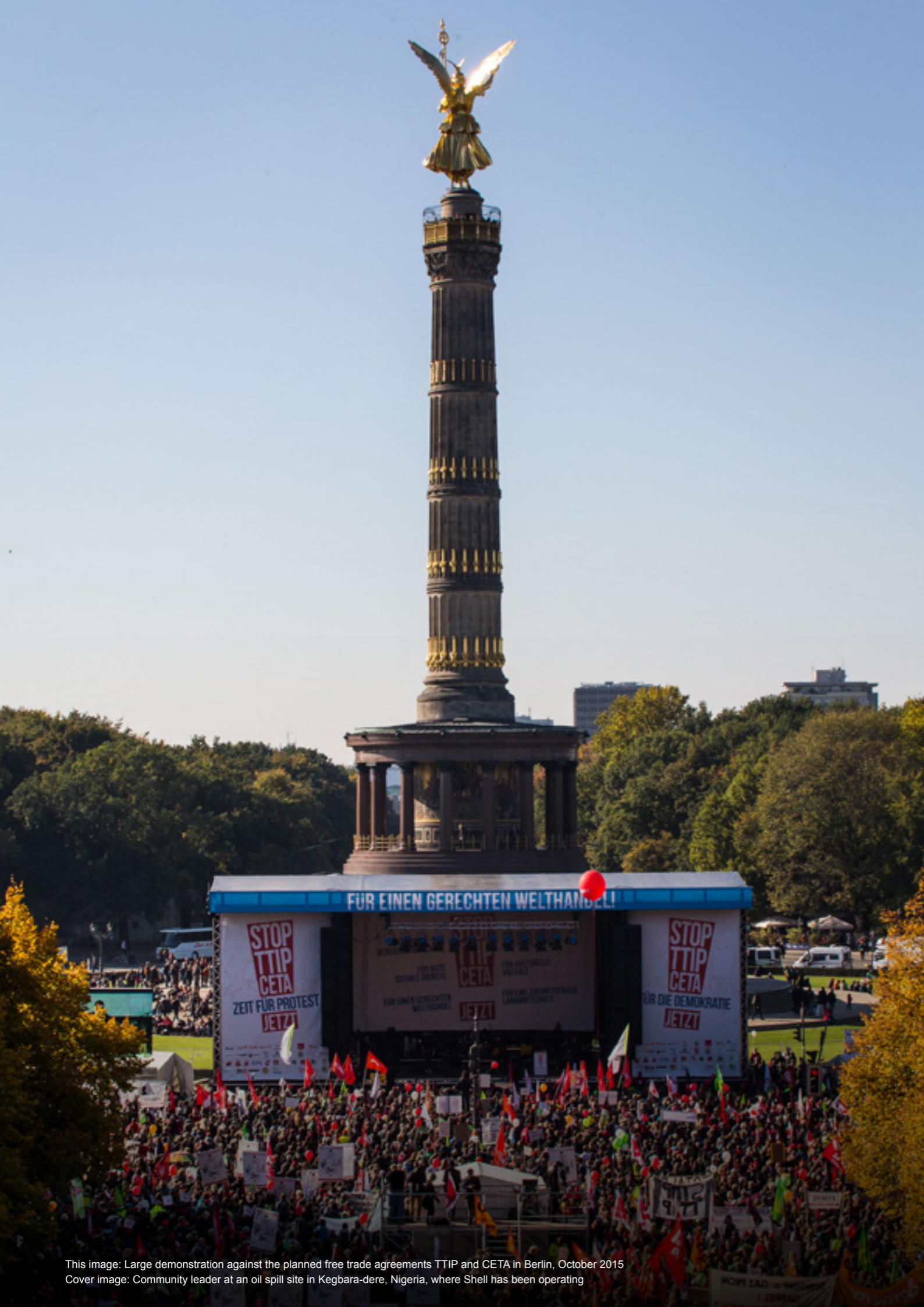
This image: Large demonstration against the planned free trade agreements TTIP and CETA in Berlin, October 2015 Cover image: Community leader at an oil spill site in Kegbara-dere, Nigeria, where Shell has been operating

“If there ever was a one-sided dispute-resolution mechanism that violates basic principles, this is it.” 40 ”