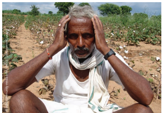
Cotton farmer, India.