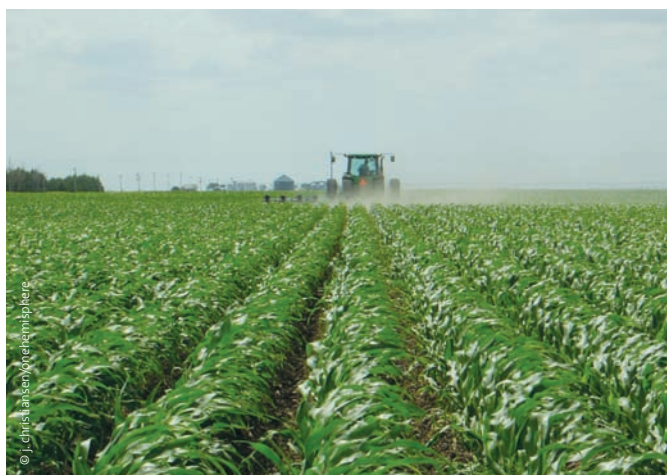
Bt Corn field, Nebraska.

Monsanto is also driving greater use of Roundup by incorporating the Roundup Ready trait in nearly every GM seed it sells. US farmers who once bought GM maize modified only to be resistant to insect pests (Bt crops) now find these varieties “stacked” with the Roundup Ready herbicide resistance trait as well. As a result, in the US, the area planted with Monsanto GM maize seed without the Roundup Ready trait fell dramatically from 25.3 million acres in 2004 to just 4.9 million acres in 2008. This “trait penetration” strategy means higher profits from both seeds and Roundup sales, and ensures farmers' dependence on GM traits and Roundup.