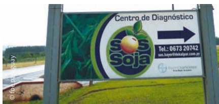
Left: Soy field in the agricultural area of Londrina, in the state of Parana, Brazil. Right: Bayer Crop Science sign, Paraguay.